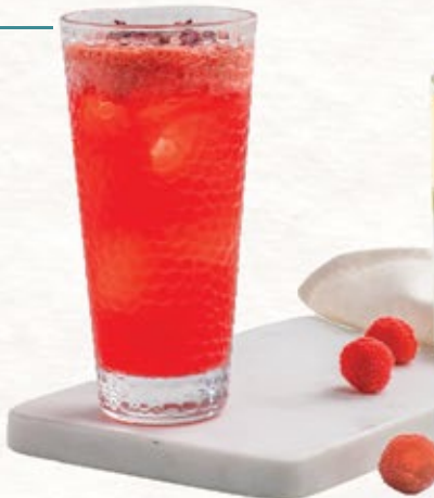
RASPBERRY ROSE ICED TEA