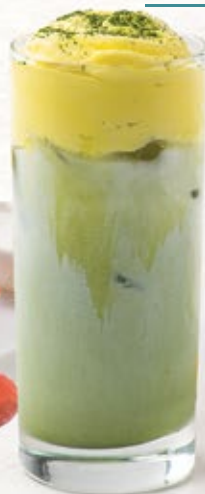
MANGO MOUSSE ICED MATCHA