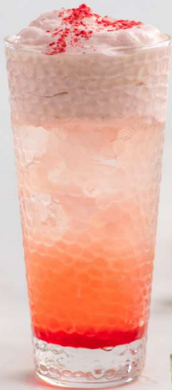
BERRY FOAM LEMONADE