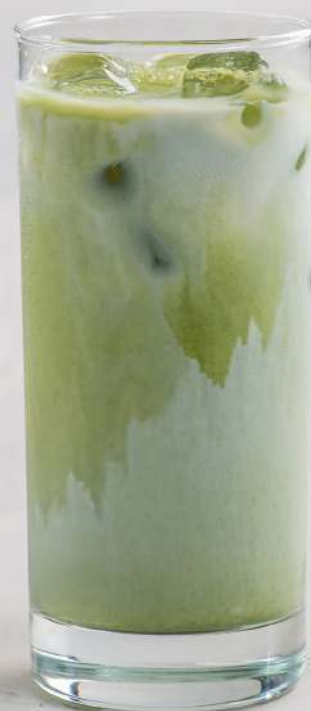
ICED MATCHA LATTE