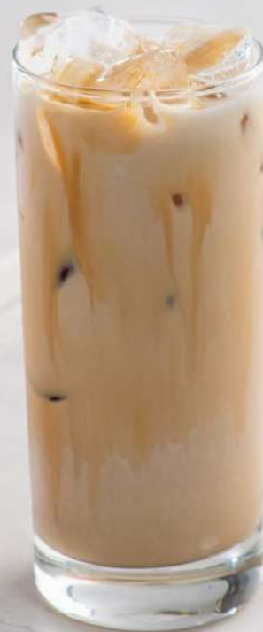
ICED SPANISH LATTE