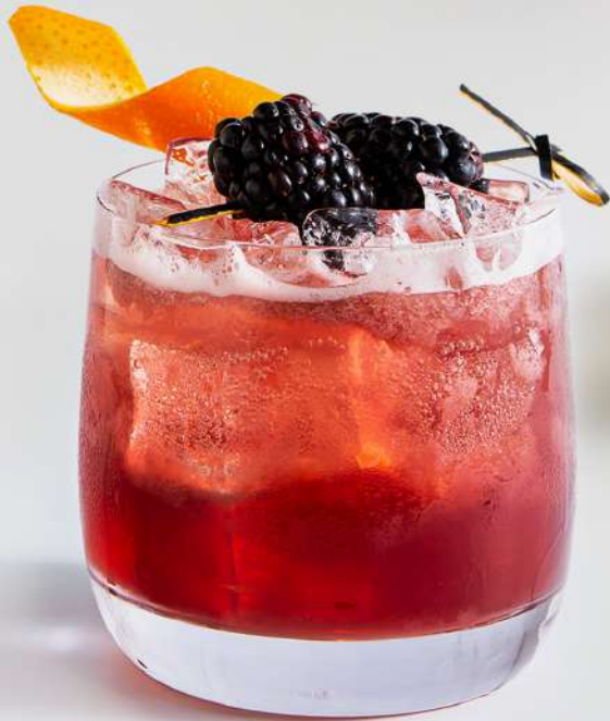
JAM GIN FIZZ