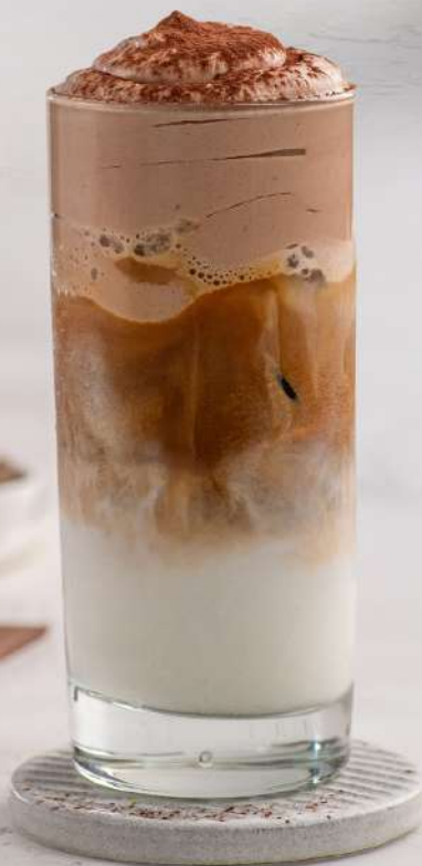
MOCHA MOUSSE ICED LATTE