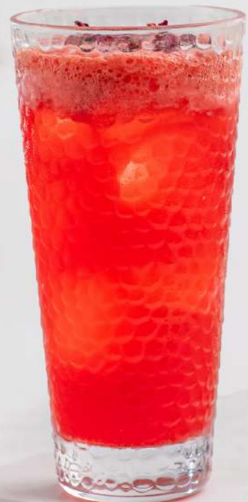
RASPBERRY ROSE ICED TEA