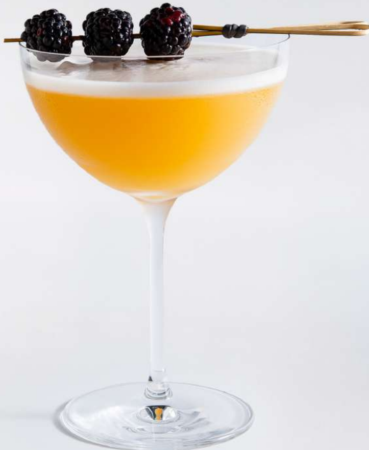
CATCH ME IF YOU CAN