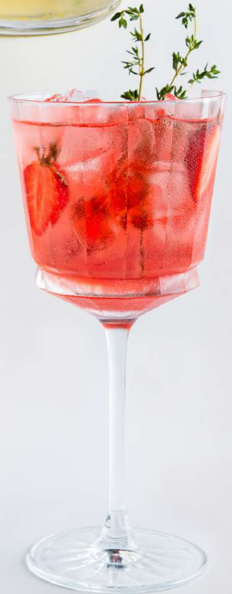
SINK WITH THE PINK