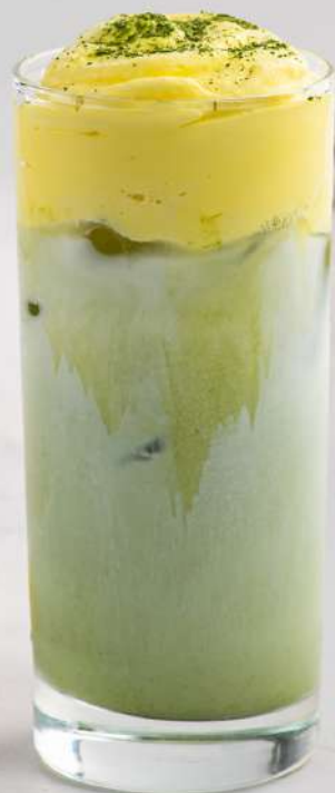
MANGO MOUSSE ICED LATTE